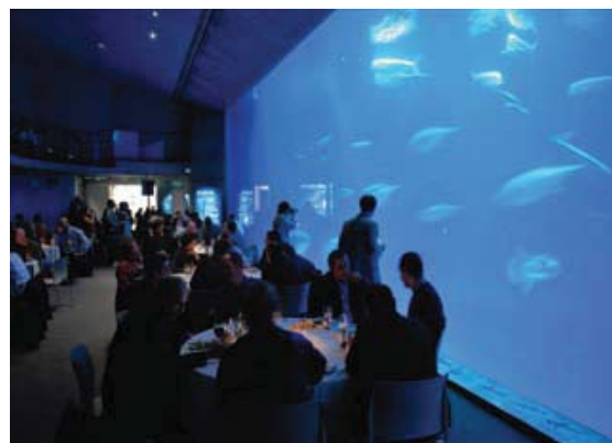
See the wonders of the Monterey sea canyon as you dine with your 6Sight colleagues at the Monterey Bay Aquarium