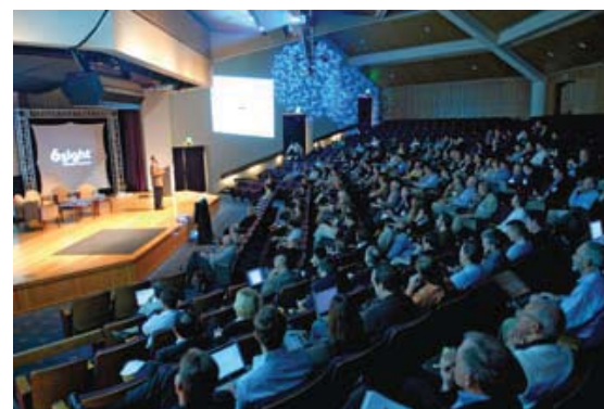
The Monterey Conference Center welcomes the 6Sight Future of Imaging Conference to one of the best conference venues in the U.S.