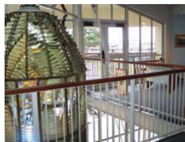
Monterey Maritime Museum hosts the 6Sight Welcome Reception.