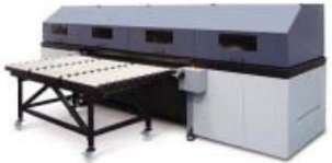
PHOTO LABS AND PHOTO RETAILERS CAN EXPAND THEIR CAPABILITIES WITH DURST THETA DIGITAL IMAGERS. THE THETA 76 / 76HS / 76BW "LARGE-FORMAT MINILABS" ARE ALL-IN-ONE SYSTEMS WITH AUTO-NESTING SOFTWARE, TRUE VARIABLE BACK PRINTING, AND PRODUCTIVITY APPROACHING TRADITIONAL MINILABS THANKS TO THEIR 30-INCH PRINTING WIDTH.

THEY PRODUCE ANY SIZE PHOTO, FROM 3.5X5-INCH PRINTS TO PANORAMICS 30 INCHES WIDE UP TO 13 FEET LONG, AND OFFERS OUTSTANDING PRODUCTIVITY - UP TO 550 8 X 10-INCH PRINTS PER